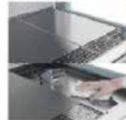
Compartmented working surface is easy to be sterilised and cleaned.