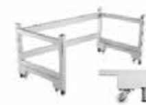
Adjustable chassis adapts to different height requirements.