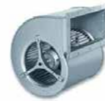
EBM DC Fan, Energy consumption as low as 112W, Low noise to 58 dB.